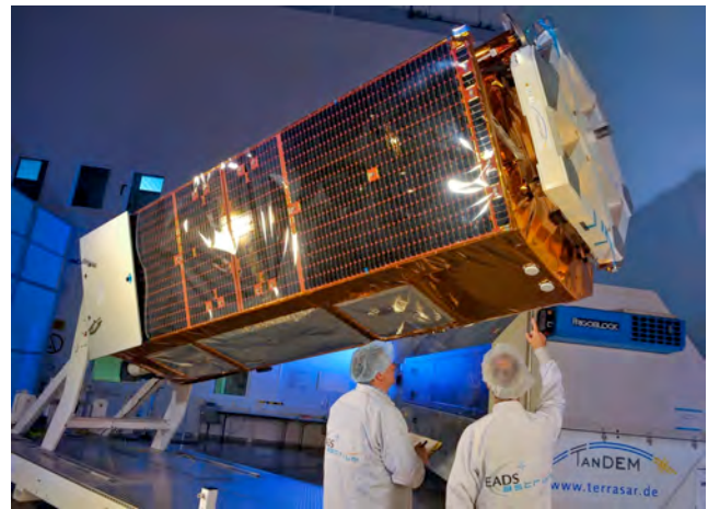
TanDEM-X radar satellite

Shortly after separation from the Dnepr launch vehicle, successful system checks were carried out on the satellite during the Launch and Early Orbit Phase, including the Cold Gas Propulsion System, which incorporates the AMPAC-ISP Europe components. Cold Gas System thruster manoeuvres were also carried out and the results were as expected.